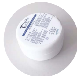
conductive cream 100 ml