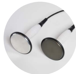
resistive and capacitive electrodes Ø 75 mm