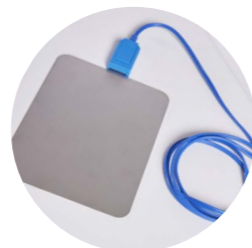
rigid stainless steel return plate