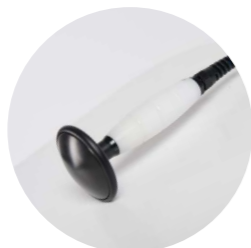
convex capacitive electrode