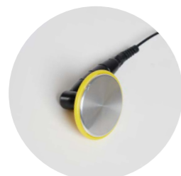
dynamic return electrode