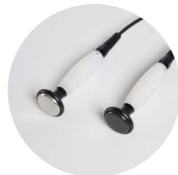
resistive and capacitive electrodes Ø 35 mm