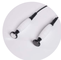
resistive and capacitive electrodes Ø 25 mm