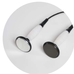
resistive and capacitive electrodes Ø 55 mm