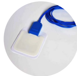
resistive functional electrode