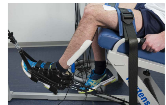
Treatments with resistive functional electrode and adhesive return plate.