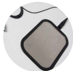
flexible stainless steel return plate