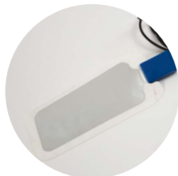
adhesive return plate