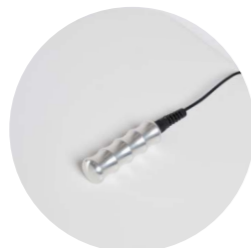
cylindrical resistive handpiece