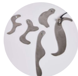
Manual Assisted Therapy Kit