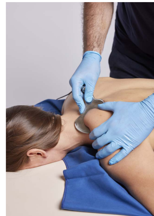
Assisted Manual Treatment with one of the kit instruments and a return plate.